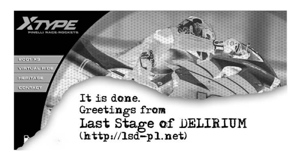
Figure 4.3: The defaced homepage of fictional company xType Moto-Rockets

Upon the technique, presented above in detail, the attack against Solaris operating system with security enhanced by Pitbull Foundation has been completed successfully and websites has been defaced (the first such action in the long history of LSD).